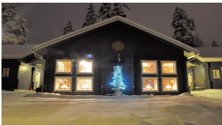
‘Tervetuloa IPA-Majalle – Welcome to the IPA Hut’